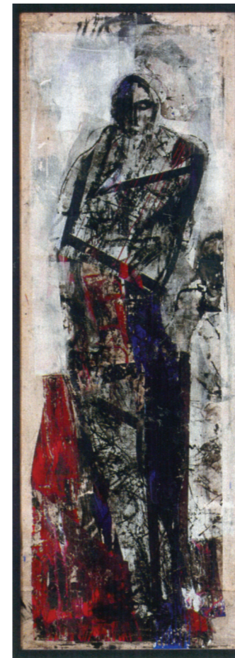
Levo: Modra oseba, 200 x 50 cm, 2008, platno, mešana tehnika Desno: Ecce Homo, 200 x 70 cm, 1992/2006, platno, mešana tehnika